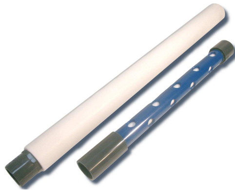
Figure 1: CP15 (left) and CP1 (right) models

The CP piezometer series consist of a porous plastic filter, which is crush resistant for CP15 model and protected inside a perforated rigid PVC body for CP1 model. An adaptor allows the use of PVC riser pipes. The latter are provided with flush screw joints.