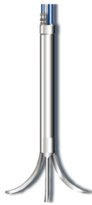
Hydraulic Borros-Type Anchors