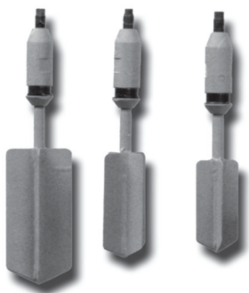
Vanes with slip coupling

The vanes are made of high ultimate strength (1 700 000 kPa) tempered, chrome-nickel steel. A special slip coupling allows for using only one set of rods. The very low friction bearing in this sealed coupling permits a free slip, or “play”, of approximately 15° between the rods and the vane. During the test, the rod rotates first until the play has disappeared, after which the rod and vane rotate together. On the test record shown at right, M_f is the torque required to turn the rods only. The maximum torque required to turn both the rods and the vane is M_s . The difference ( M_s - M_f ) determines the soil's shear strength. Note that the reduction in shear strength after failure is easily determined by a remolded strength test at the same test depth.